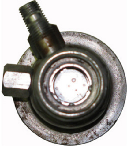
15-51 Type-1 POA VALVE *