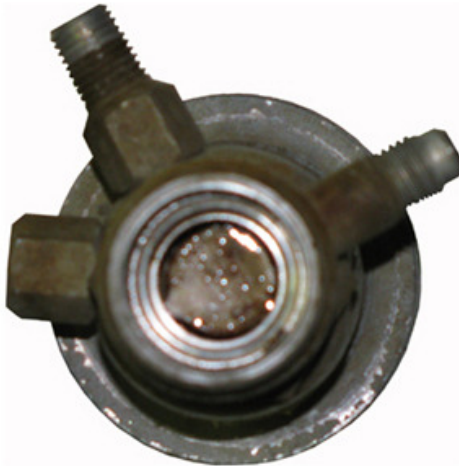
15-51 Type-2 POA VALVE